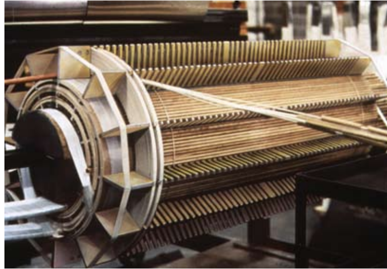
Ventilated Dry-Type Transformer Coil. Both SG-200 and FHT Laminates are used in a wide variety of dry-type transformer applications.

Grade SG-200 is available in thicknesses of 1/32" to 1 1/4". Special sheet sizes of 64" x 64" are available for large lifting magnets.